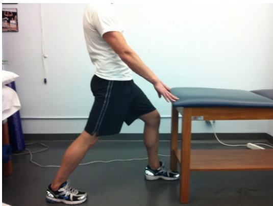
Standing Hip Flexor Stretch

The same stretches are performed below if patient has no stool: