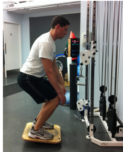
Mini Squats on Balance Board