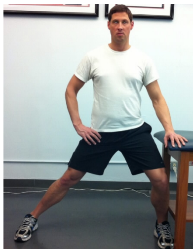
Standing Adductor Stretch