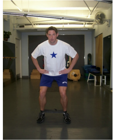
Side Stepping with Theraband